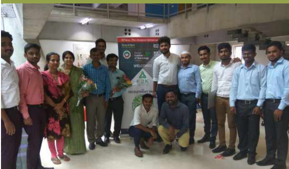
Placement Drive @ His Grace, Residency Road, Bangalore