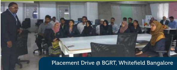
Placement Drive @ BGRT, Whitefield Bangalore