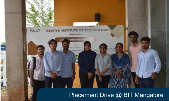
Placement Drive @ BIT Mangalore