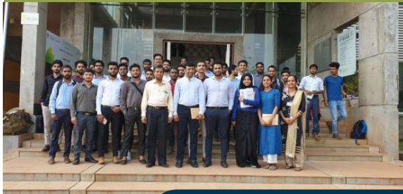
Placement Drive @ BIT, Mangalore