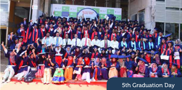
5th Graduation Day