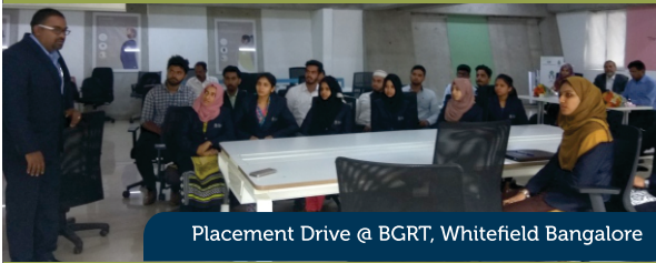
Placement Drive @ BGRT, Whitefield Bangalore