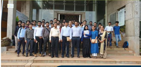
Placement Drive @ BIT, Mangalore