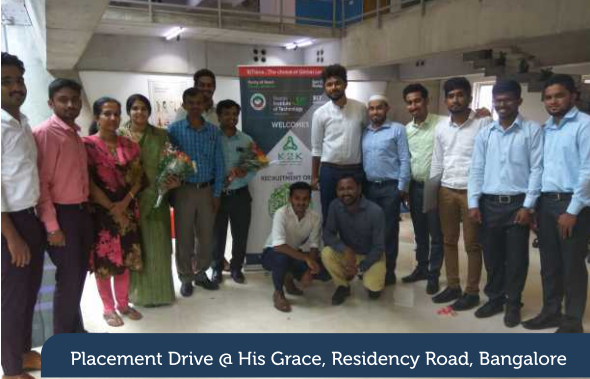
Placement Drive @ His Grace, Residency Road, Bangalore