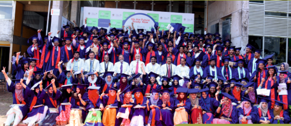
5th Graduation Day