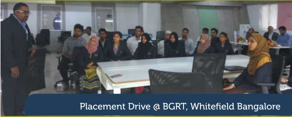
Placement Drive @ BGRT, Whitefield Bangalore