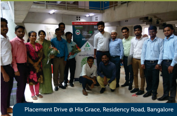
Placement Drive @ His Grace, Residency Road, Bangalore