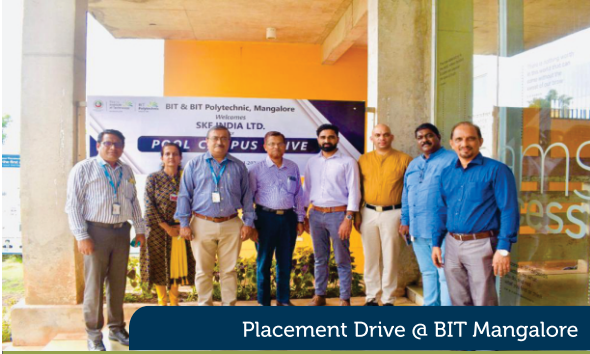
Placement Drive @ BIT Mangalore